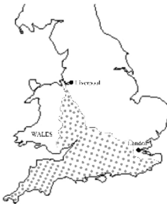
Figure 2: A representation of the r-pronouncing areas (shaded) in England. (Adapted from Crystal 87).