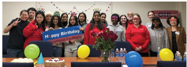
February Birthday Celebration (February 21)

OIP throws a birthday party on the 3rd Friday each month at the W230 Conference Room for international students born in the same month. It is a fun time to celebrate our International Cardinals' birthday together, taste delicious birthday cake, and create new friendships.