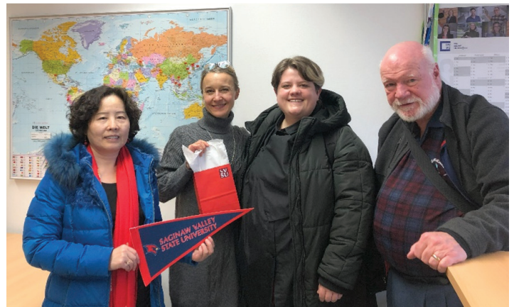
SVSU Delegation Visiting College of Business at U of Wuerzburg in Germany.