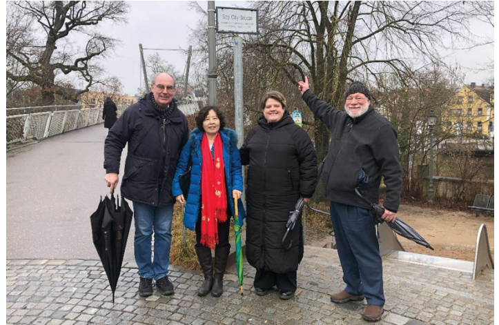
SVSU Delegation Visiting the Bay City Bridge in Ansbach, Germany.

The delegation also paid a short visit to Gunzenhausen and was received by the Gunzenhausen Sister City Committee members, including the city major. They learned more about the history of the city and its sister city relation with Frankenmuth in Michigan. Our exchange programs are also part of the sister city relationships between the local communities with Germany. Ansbach is the sister city of Bay City. SVSU will receive a 7-member delegation from Ansbach University in May 2025 to strengthen our international partnerships.