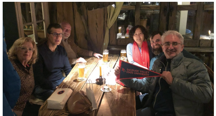
SVSU Delegation Meeting with Gunzenhausen Sister City Committee Members.