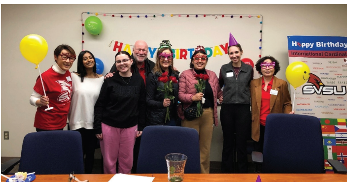
December and January Birthday Celebration (January 17)