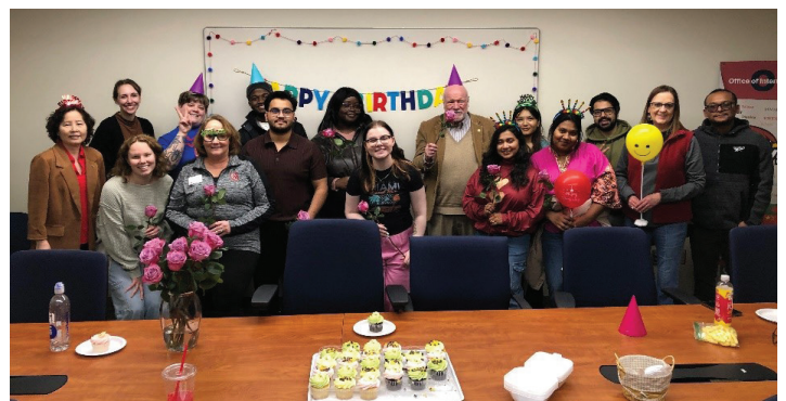
March Birthday Celebration (March 21)