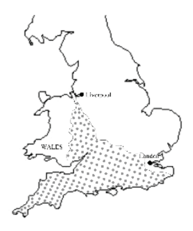
Figure 2: A representation of the r-pronouncing areas (shaded) in England. (Adapted from Crystal 87).