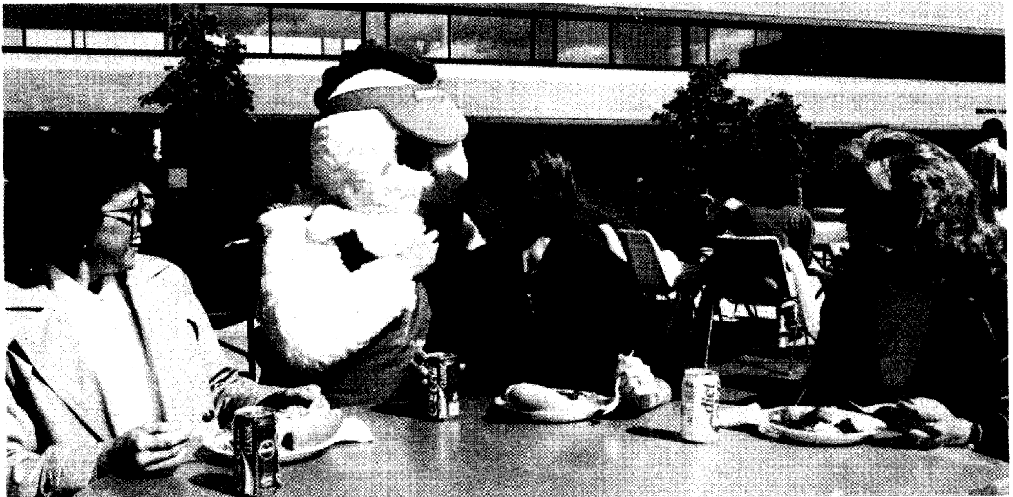
A LITTLE PECK ON THE BEAK — Some people love to eat their chicken, and some just love the chicken. At any rate, Student Government treated the campus community to food, music and a vari-

A complimentary ticket is available upon request to each SVSU faculty and staff member. Call ext. 4159 to reserve a ticket.