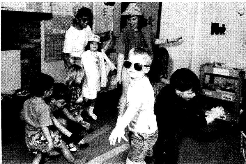
SURF'S UP, DUDE — Children and staff at the SVSU Children's Center chased the winter blues away with a week of fun "Fantasy Vacation" activities. Imaginary trips were taken to Hawaii, Disney World, the Bahamas and camp grounds.

Plans call for the first lectures to be presented during the 1993-94 academic year, the others during 1994-95 and 1995-96.