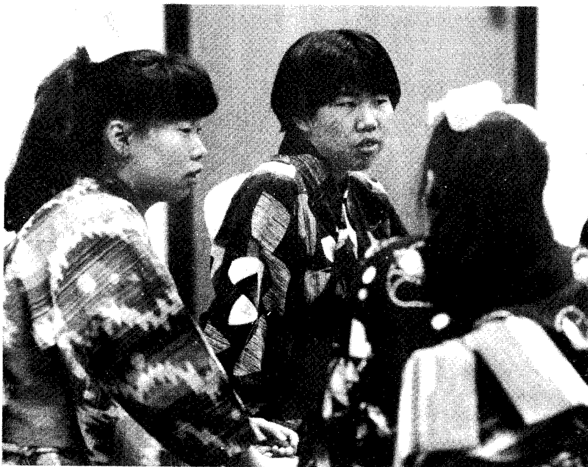
INTERNATIONAL DANCE -- Students from Shikoku Women's University rehearse a traditional Japanese dance in preparation for Saginaw's 15th annual Ethnic Festival on Aug. 5 in downtown Saginaw. Above, the women performed for various campus offices, including International Programs. A farewell reception for the students will be from 3:30 to 5:30 p.m. in Lower Level Doan.