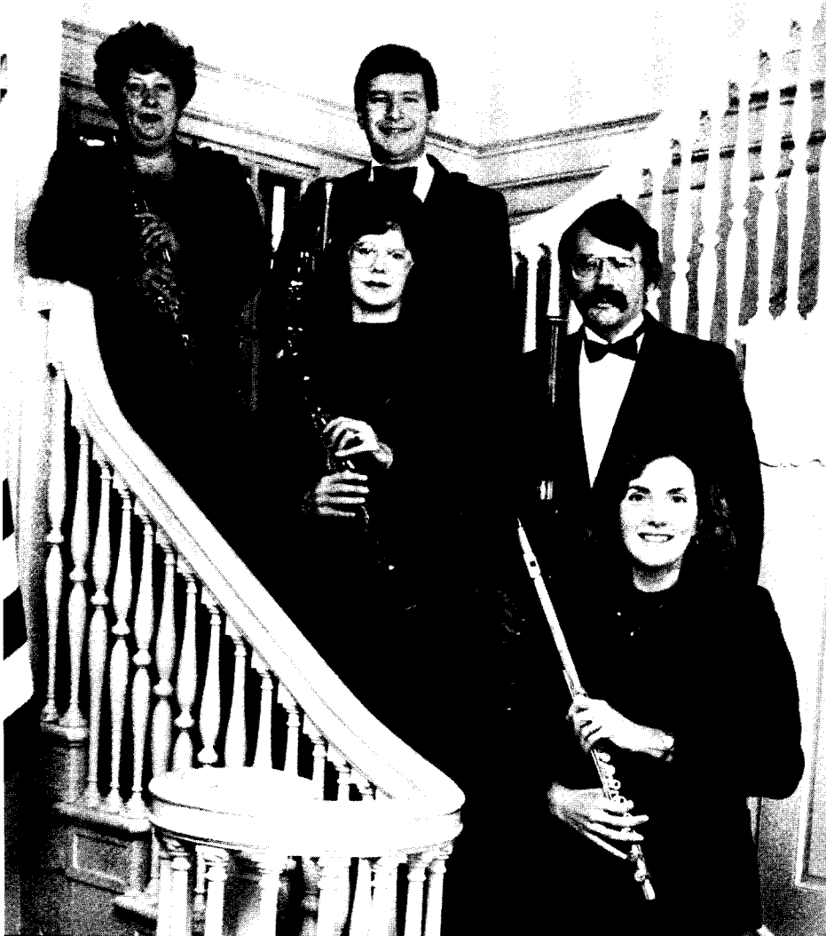
The Valley Woodwind Quintet begins its fifth year of performances with a concert on Nov. 17. Members of the quintet include SVSC faculty.