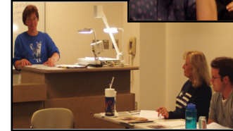
Teachers teaching teachers