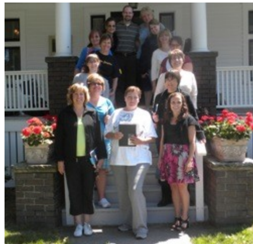
2010 SBWP Summer Institute Fellows

Join us for the 2011 Summer Invitational Institute June 20-July 15